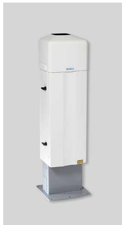
Vaisala Ceilometer CL31 measures cloud base height and vertical visibility in all weather - good or bad.

The CL31 is easy to install. It has a radiation shield that protects the unit during precipitation and against excessive heat or cooling in extreme temperatures. The automatic window blower with heater improves performance by keeping the window clean and dry. In cold conditions heating prevents frost generation on the window.